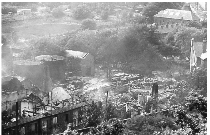
Chemstar factory disaster. The factory set fire, and set alight nearby homes (top right). The message: keep factories and housing apart!

Our Council are allowing plans to build an industrial estate (which could include anything from chemical factories to mining!) in Mottram right beside housing. We say they should be kept well separated.